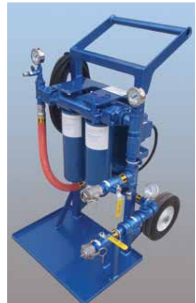
10 GPM Dual Spin-On Filter Cart