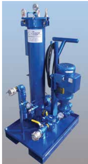
10 GPM 840X Kidney Loop Filtration System