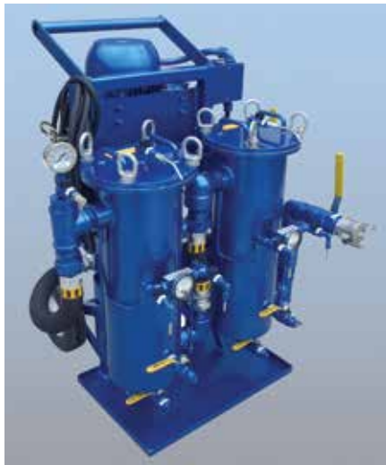
10 GPM Dual 820X Filter Cart for High Viscosity Oil

A filter cart should be used for oil transfer, new fill and top off.