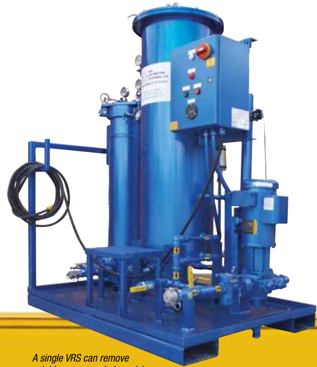
A single VRS can remove soluble or suspended varnish depending on which media is employed in a common housing.

R emove soluble varnish from warm oil and suspended varnish from cool oil. Varnish (also known as lacquer, sludge, or tar) is a detrimental by-product of oxidation, additive drop-out, and thermal degradation of lube oil. Certain system designs and operational conditions (such as high oil temperature, electrostatic spark discharge, high oil flow rates, etc.) contribute to the rapid formation of varnish in oil. In severe cases, varnish tends to “plate out” on the metal surfaces within a lube oil system, and if left unchecked, the build-up of varnish deposits on servo valves and other critical components can lead to “stiction,” inefficient operation of rotating equipment, higher operating temperatures, and premature failure.