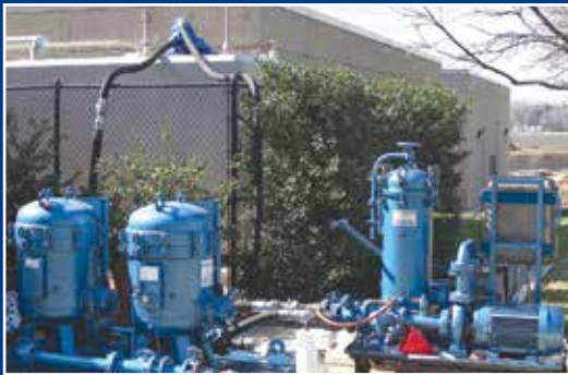
Same day / next day response! We are the “911” of oil and fuel filtration!

Rental costs can be applied towards the purchase price of a new unit, if desired.