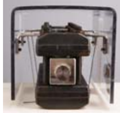
SafeView Shields mounting accommodates all standard flat glass gages.

– Project Engineer , Major Chemical Company