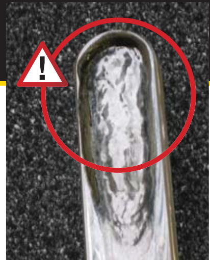
Dangerously eroded gage glass. Eroded glass is often not visible without inspection of disassembled gage.